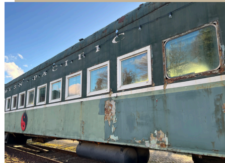
Passenger car ready for restoration

The PDHC Rolling Stock committee is working with a local contractor and a paint consultant to plan technical aspects of the rolling stock restoration project and how to make the next paint job last as long as possible. Repainting the passenger car and caboose is tentatively scheduled to begin in January 2026. This project will be funded with a combination of grant funds and community donations.