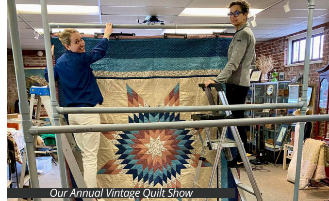
Our Annual Vintage Quilt Show