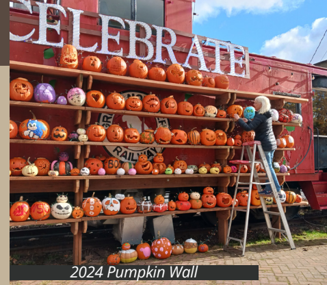
2024 Pumpkin Wall

Site Work: Supplied and tended by The Phoenix Conservancy, plants native to the endangered Palouse Prairie are beginning to cover the hillside. The roof gutter drainage system will be overhauled with new lines, clean-out points, and a catch basin.