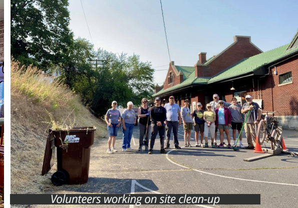
Volunteers working on site clean-up